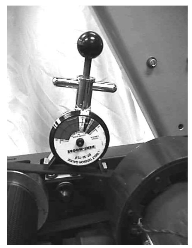
Diagram 4.2 ó Drive Belt Tension Gauge